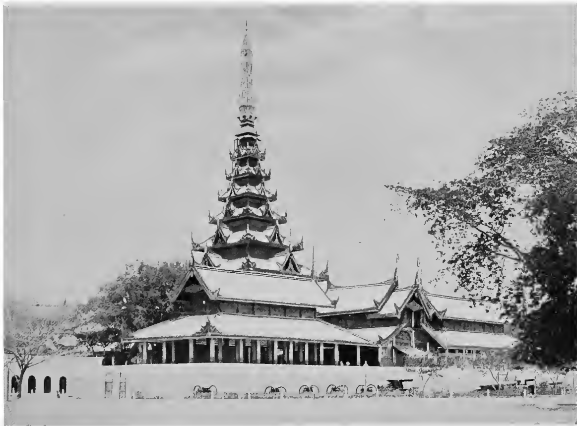
The Palace, Fort Dufferin, Mandalay